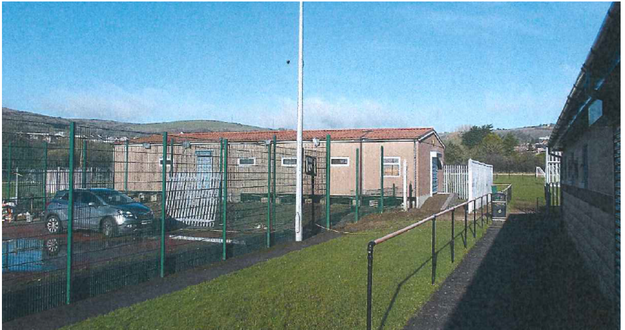
Characteristics of the Site and Area